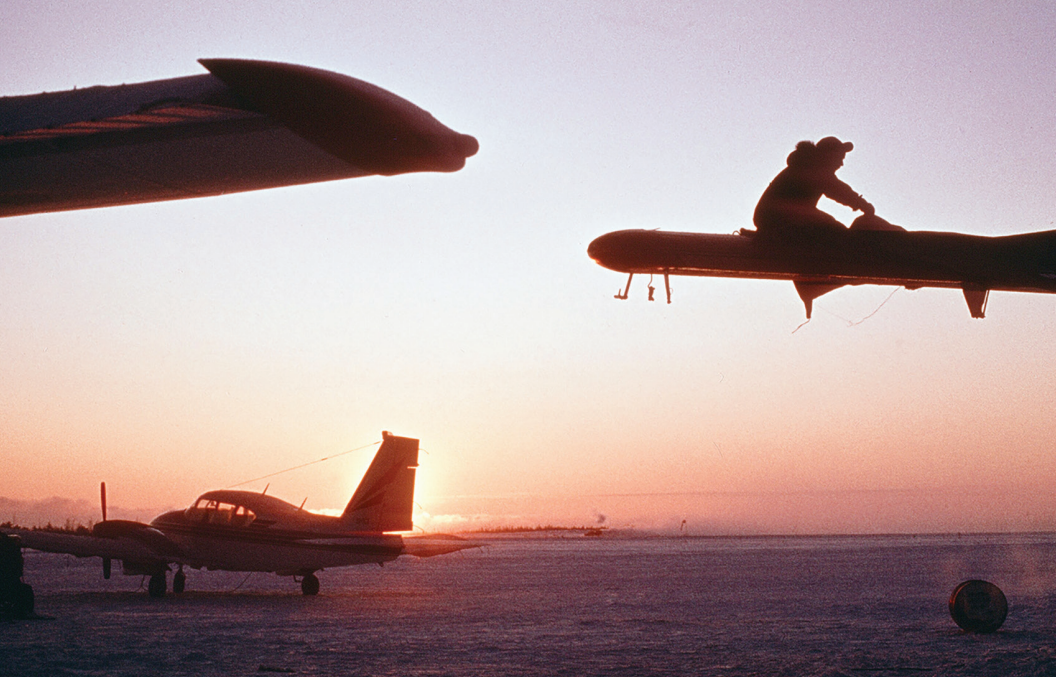
Danny Pappas, the Gateway Aviation dock boy, de-icing an Otter wing in Yellowknife.

We were reaching open water at the other end of the lake, and the question was: do I shut down the engine, do some water-skiing across the end of the lake, and finish the run in the rocks and trees at the foot of the hill, or do I keep on going flat-out in the hope of climbing over the trees and the hill? I thought about it for a while and after carefully weighing the pros and cons I lost the option to land on the water. It was too late for that, so we continued going flat-out.