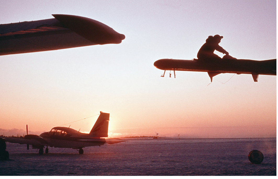
Danny Pappas, the Gateway Aviation dock boy, de-icing an Otter wing in Yellowknife.

We were reaching open water at the other end of the lake, and the question was: do I shut down the engine, do some water-skiing across the end of the lake, and finish the run in the rocks and trees at the foot of the hill, or do I keep on going flat-out in the hope of climbing over the trees and the hill? I thought about it for a while and after carefully weighing the pros and cons I lost the option to land on the water. It was too late for that, so we continued going flat-out.